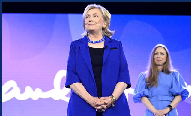
Secretary Clinton and Chelsea Clinton during the CGI 2023 Annual Meeting. (2023)

■ Through the CLINTON PRESIDENTIAL CENTER and our PROJECT42 INITIATIVE , we also spent the year marking important moments during the Clinton administration that continue to make a meaningful difference for millions of people. In April, we marked the 25th anniversary of the historic Good Friday Agreement, which ended decades of sectarian violence