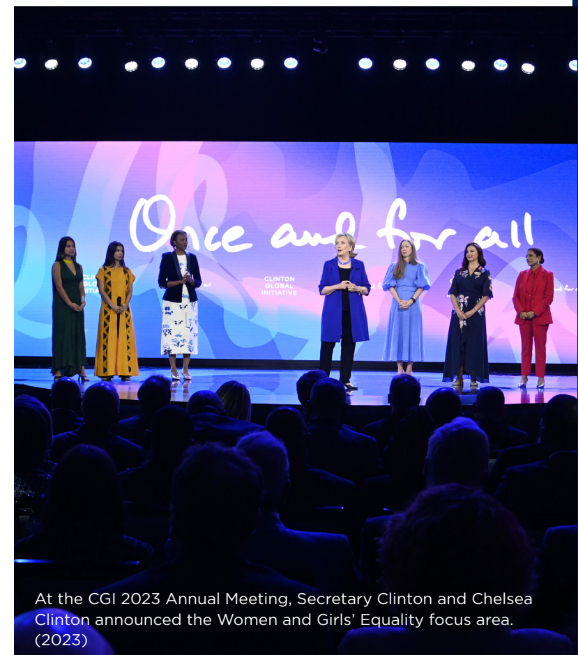
At the CGI 2023 Annual Meeting, Secretary Clinton and Chelsea Clinton announced the Women and Girls’ Equality focus area. (2023)

The CGI community will reconvene September 23-24, 2024, in New York City for the 2024 Annual Meeting. Look for us on the “Road to September” beforehand, with stops and dates to be announced soon. Visit clintonglobal.org/2024 for updates on this year’s meeting.