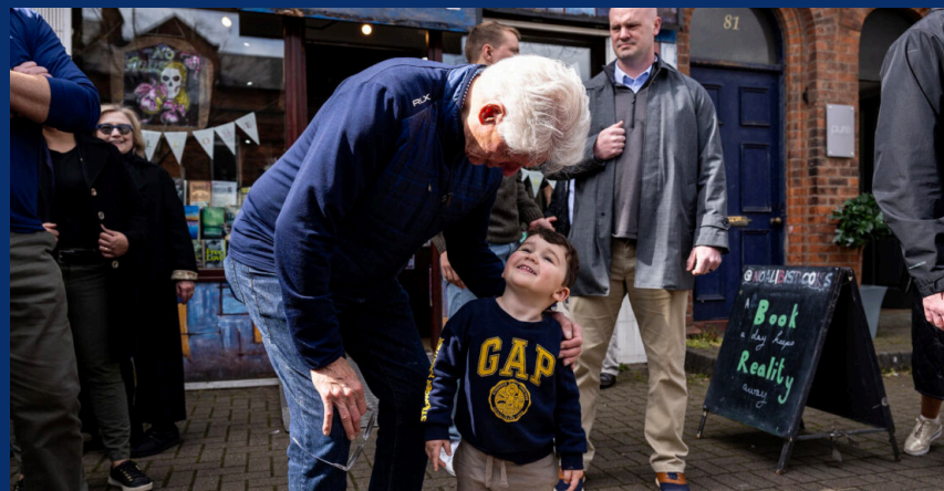
President Clinton visits Northern Ireland to mark the 25th anniversary of the Good Friday Agreement. (2023)

in Northern Ireland and established a framework for shared government. In addition, two major programs — the Family Medical Leave Act (FMLA) and AmeriCorps — turned 30 this year. Since they were established, FMLA has been used more than 400 million times, and more than 1.2 million volunteers have served their communities through AmeriCorps. Behind each of these numbers are stories about real people benefiting from common sense policy solutions.