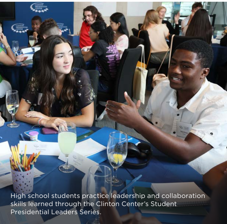
High school students practice leadership and collaboration skills learned through the Clinton Center’s Student Presidential Leaders Series.

The Clinton Center welcomed its newest class of Student Presidential Leaders in 2024 — an energetic group of Arkansas high school students eager to create change. Over the year-long program, they honed their leadership skills, embraced inclusivity and respectful dialogue, and actively engaged in civic life. By developing community action plans, they addressed local needs and built a network of changemakers committed to making a meaningful difference in their communities.