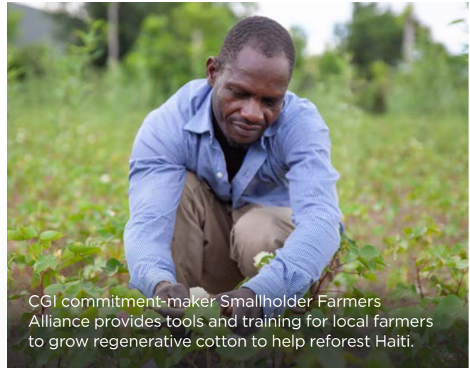
CGI commitment-maker Smallholder Farmers Alliance provides tools and training for local farmers to grow regenerative cotton to help reforest Haiti.

CGI remained dedicated to lifting entrepreneurs and emerging leaders through its platform. CGI University shifted its focus to build out programming and year-round engagement opportunities through CGI's Annual Meeting and Action Network platforms — elevating youth voices and providing more meaningful connections to changemakers. CGI Greenhouse, which supports impact enterprises ready to scale, achieved a notable outcome: 25% of participants received direct investments because of their CGI connections. In addition, CGI launched the CGI Creators Experience to engage content creators and influencers to more deeply reach and engage younger audiences in making complex issues accessible and actionable.