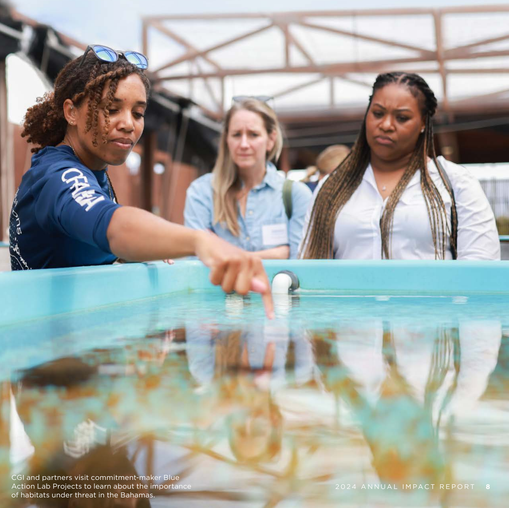
CGI and partners visit commitment-maker Blue Action Lab Projects to learn about the importance of habitats under threat in the Bahamas.

In 2024, we saw the collective efforts of 175 CGI Commitments to Action drive change worldwide. From climate resilience projects reaching 100 countries, to economic opportunities that created nearly 3 million jobs, the progress is undeniable. With billions of dollars invested and millions of lives impacted, these results continue to inspire our work, proving what can be achieved when we take action together.