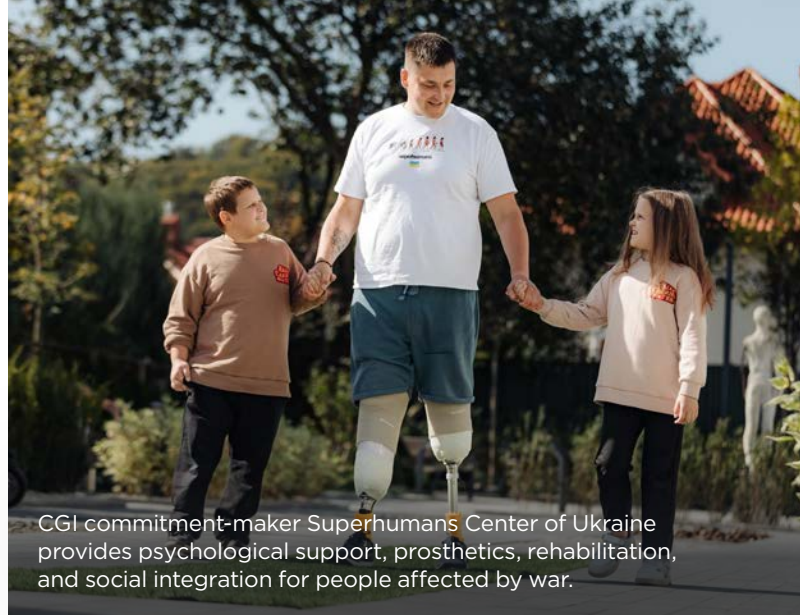
CGI commitment-maker Superhumans Center of Ukraine provides psychological support, prosthetics, rehabilitation, and social integration for people affected by war.