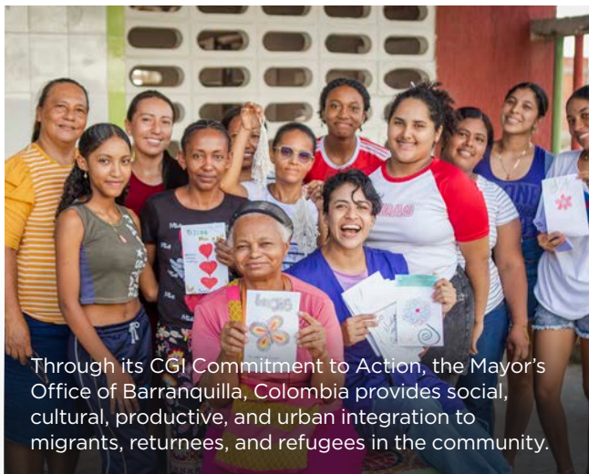
Through its CGI Commitment to Action, the Mayor's Office of Barranquilla, Colombia provides social, cultural, productive, and urban integration to migrants, returnees, and refugees in the community.

The economic inclusion team worked with CGI commitment-makers to accelerate innovative solutions to broaden educational and economic opportunities, including through catalytic capital, employment-driven national service programs, generative AI and other technologies, workplace financial empowerment, and affordable housing financing. When fully funded and implemented, these commitments will span five continents, create nearly 3 million jobs, provide education to 2 million students, and secure $400 million for communities that are historically under-resourced.