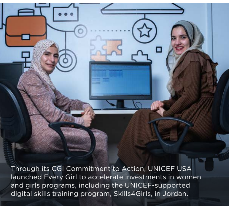
Through its CGI Commitment to Action, UNICEF USA launched Every Girl to accelerate investments in women and girls programs, including the UNICEF-supported digital skills training program, Skills4Girls, in Jordan.

Too Small to Fail launched a groundbreaking statewide early literacy campaign in Pennsylvania in partnership with the Barbara Bush Foundation for Family Literacy and the United Way of Pennsylvania. The program will pilot with United Ways across the state, building upon and adapting early learning strategies to meet families where they are in their local communities. They also continued to innovate and lead in the field of early childhood development — exploring the impacts of climate change on children's healthy development and bringing new research and best practices for raising awareness on these issues to Hollywood.