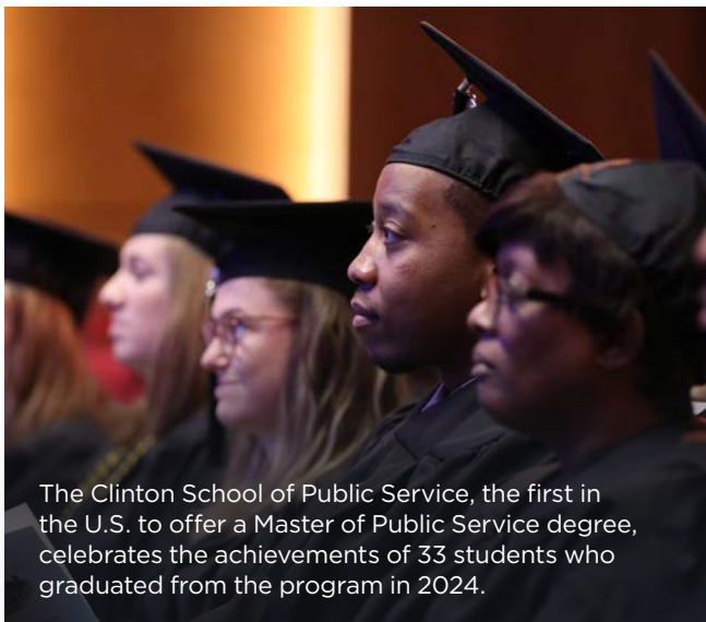
The Clinton School of Public Service, the first in the U.S. to offer a Master of Public Service degree, celebrates the achievements of 33 students who graduated from the program in 2024.

The Clinton School of Public Service was established by President Clinton 20 years ago as an action-oriented master’s degree program. In 2024, students launched a peer-to-peer mental health initiative to support female youth in rural Arkansas, researched digital literacy as a means of economic opportunity in Botswana’s Kgalagadi South district, and conducted a policy analysis for a global nonprofit aimed at improving education and expanding economic opportunity across the U.S. and more than 80 countries. 33 students graduated with their Master of Public Service degree from the Clinton School in 2024.