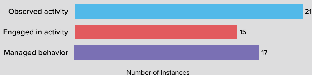
Figure 2: Parent-Child Activity in Laundromat